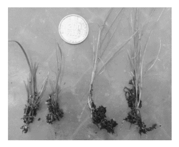
Figure 2. Ex vitro acclimatized plants from semisolid (left) and double phase (right) multiplication media, respectively.

Plants cultured in both systems had a complete survival percentage (100%) seven weeks after transfer to ex vitro conditions; however, plants cultured in larger containers/double phase/ no transfer were in average larger (13cm) than those cultured in semisolid media with monthly transfers to fresh medium (5cm) (Figure 2); difference that may be the result of the higher reserve accumulation and rapid allocation for new organ formation in the first; however, more studies are recommended to deep into this topic.